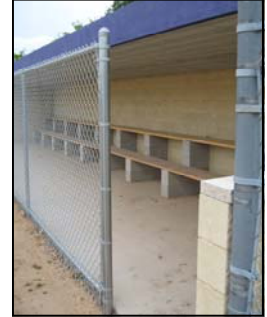
Newly renovated dugouts at McCarty Field.