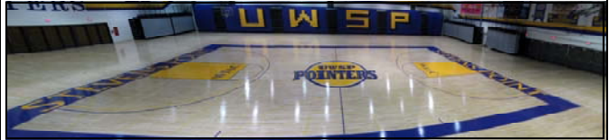
Quant Gym Floor Design.

Men's and women's basketball as well as volleyball will be playing on newly designed and refinished flooring this season. New logos and floor designs were completed in August.