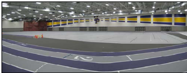
The Multi-Activity Center.

A more recent and even larger renovation was just recently completed to the Multi-Activity Center (MAC). This multi-million dollar facility is home to both men's and women's track and cross-country teams, off-season baseball, intramurals, classes, climbing wall, and countless practices when weather forces outdoor sports inside.