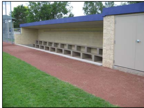
Newly renovated dugouts at University Field.

Through private funding, the baseball team has completed a field renovation consisting of new dugouts, infield, warning track, and watering system.