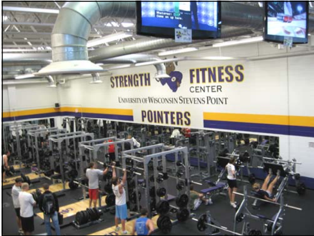
View from the second floor of the newly renovated Strength Fitness Center.

Fitness Center renovations were completed almost a year ago. This complete renovation includes a new floor, new weight and cardio equipment, eight flat screen televisions, and a layout focused on efficiency in training sports teams.