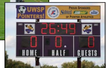
Newly renovated Point Soccer Bowl and scoreboard.