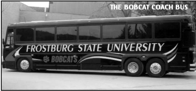
THE BOBCAT COACH BUS