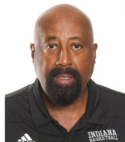
MIKE WOODSON Head Coach Second Year at IU 43-25